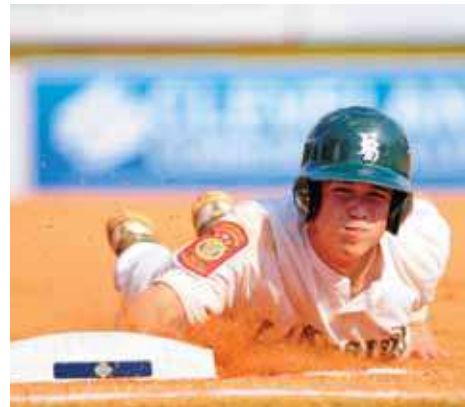
Brooklawn, N.J., handed Lakeside Recovery of Bellevue, Wash., its only two losses.